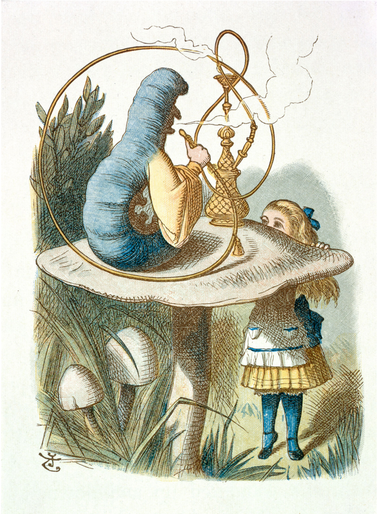
Alice in Wonderland drawing by Sir John Tenniel, in the public domain.