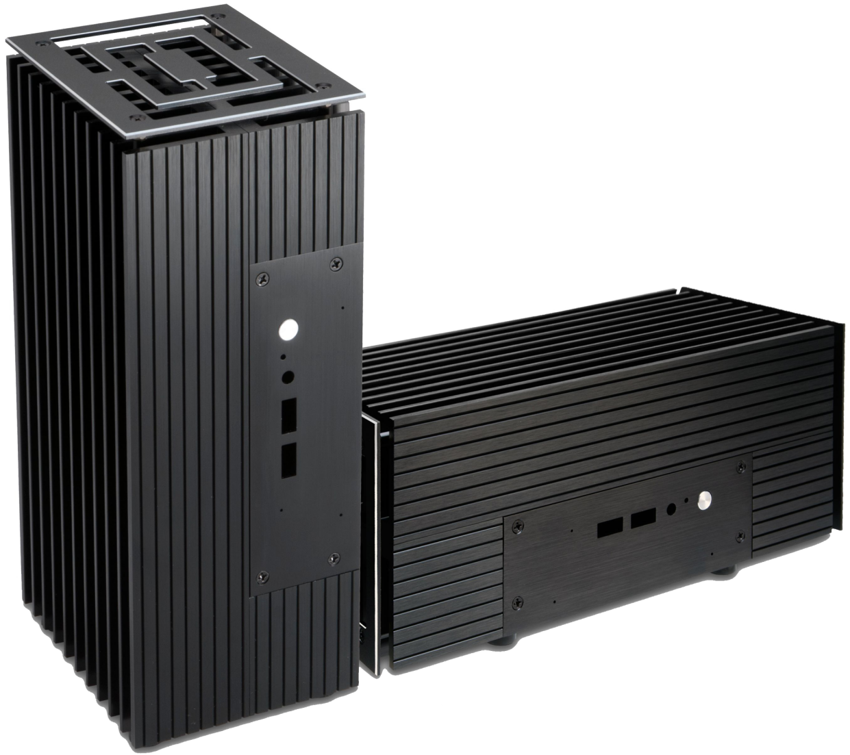
Roon Rock RS-9 Music Server (vertical and horizontal orientations)