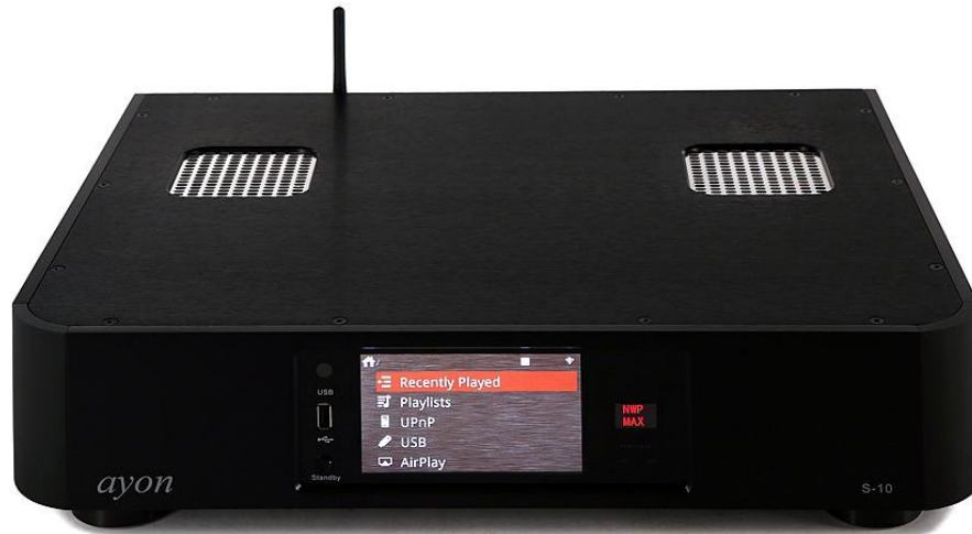
Ayon Audio S-10 II Streamer/DAC with RS-9 Music Server